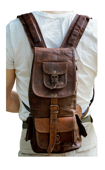
15" Backpack $49.50 EBB004