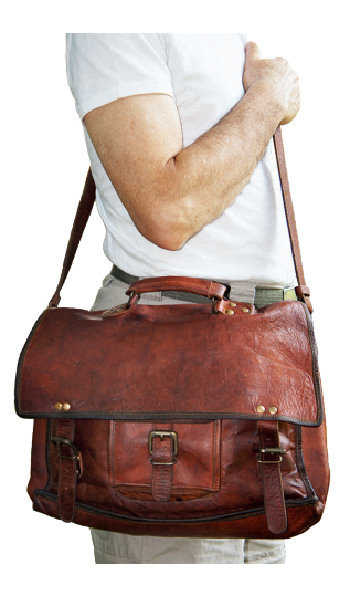
15" Laptop Bag $64.50 EBB002