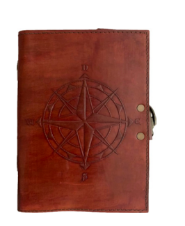
"Compass Rose" Embossed compass with c-lock 5" x 7" $17.50 | EBJ037