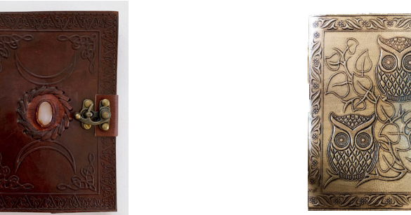
"Moonstone" Embedded gem stone with c-lock 5" x 7" $17.50 | EBJ042