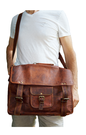
17" Laptop Bag $74.50 EBB003